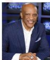
Drew Pearson Dallas Cowboy Man of Action